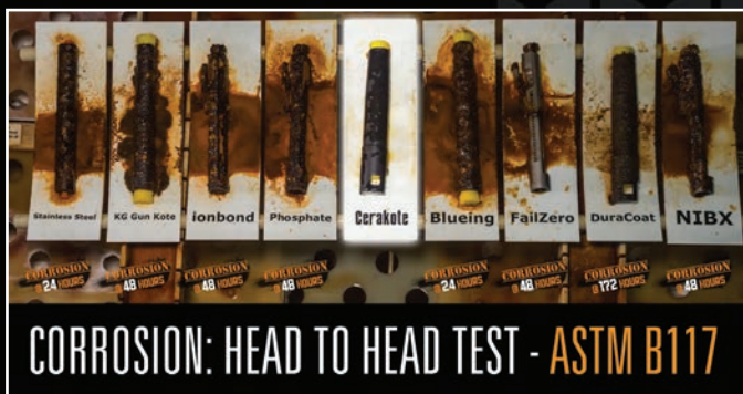
CORROSION: HEAD TO HEAD TEST - ASTM B117

Salt Spray (ASTM B117) Corrosion testing is used to evaluate the relative corrosion resistance of coated components exposed to a 5% salt solution fog with a constant temperature of 95F degrees. Cerakote® showed minimal signs of corrosion even after 3,000 hours in the salt spray chamber. This study shows that Cerakote® preserves the life of a firearm in a corrosive environment longer than any competitive finish.